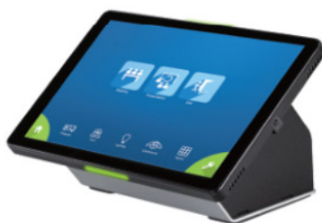
VK320 + VK102 (Tabletop Kit) VK102 is sold separately.