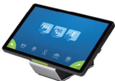
VK320 + VK101 (Tabletop Kit) VK101 is sold separately.