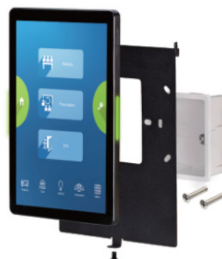
VK320 + 86-type Junction box